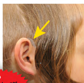
Around The Ear

TIP Round out the ear using scissors in a fashion that keeps hair length at least .20"