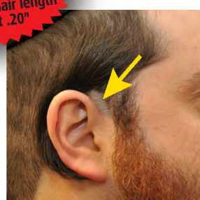
Around The Ear