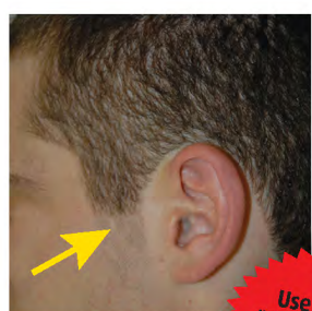
Sideburns Too Short