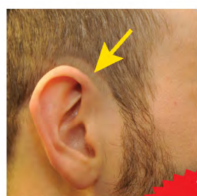
Around The Ear

All 'Common Mistakes' pictures were created by computer alteration of kosher haircut photos