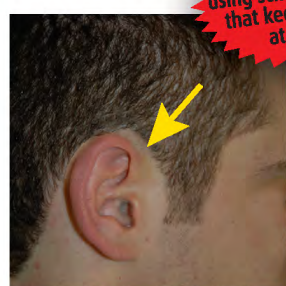
Around The Ear

TIP Round out the ear using scissors in a fashion that keeps hair length at least .20"