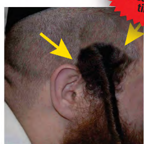
Top Of The Ear / Temple

TIP Use at least a #2 guard in these areas at all times