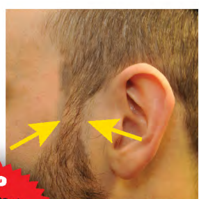
Sideburns Too Thin

TIP Use at least a #2 guard in these areas at all times