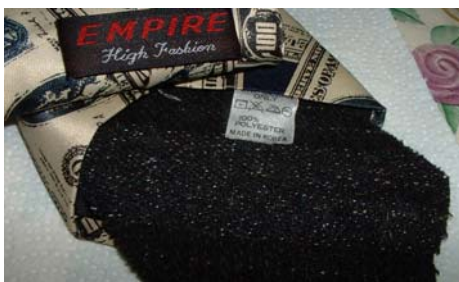
Picture of polyester tie made in Korea

◆ Polyester ties made in Korea require testing as they were found to contain recycled lining, which can contain Shatnez.